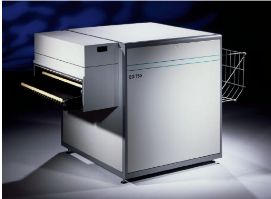
Hope EG 750 On-Line Dolev 4pressV/4news

Please note that the EG 750/EG 900 cannot be split into two sections as these processors are one-frame constructions.