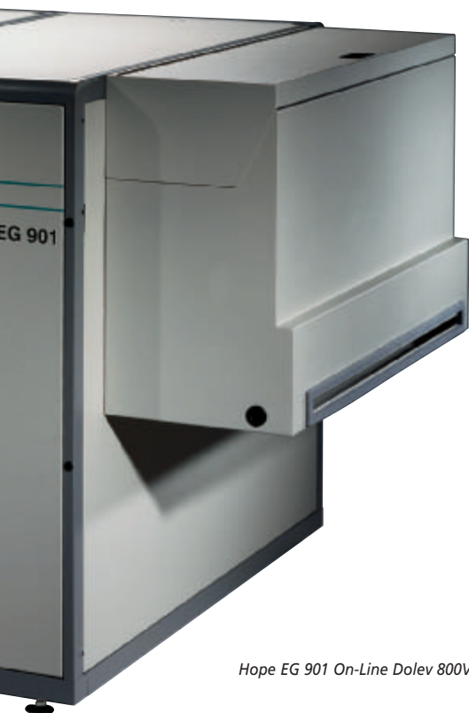
Hope EG 901 On-Line Dolev 800V/800V 2